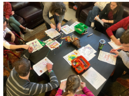
The participants enjoying an activity together at the Thanksgiving meal.